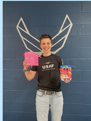
C/ Brodene came closest to guessing the number inside the jar and won!