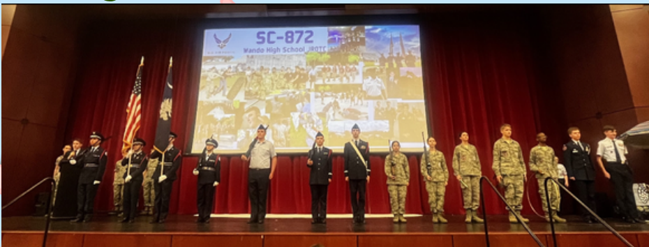
Teams and Recruiting came together to present Wando AJJROTC to the rising 9th graders!