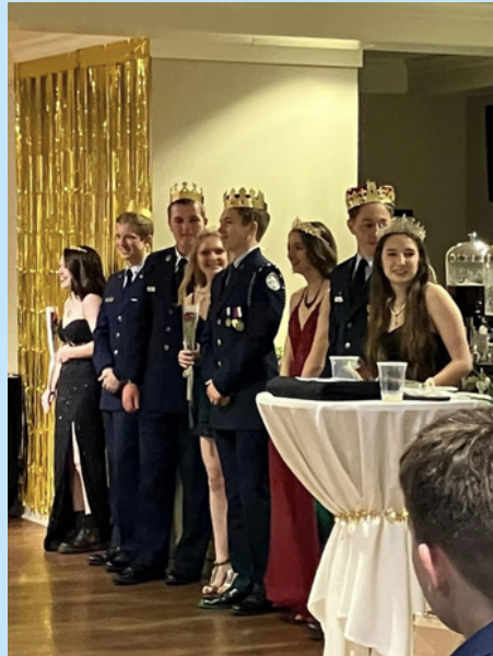
Military Ball Court